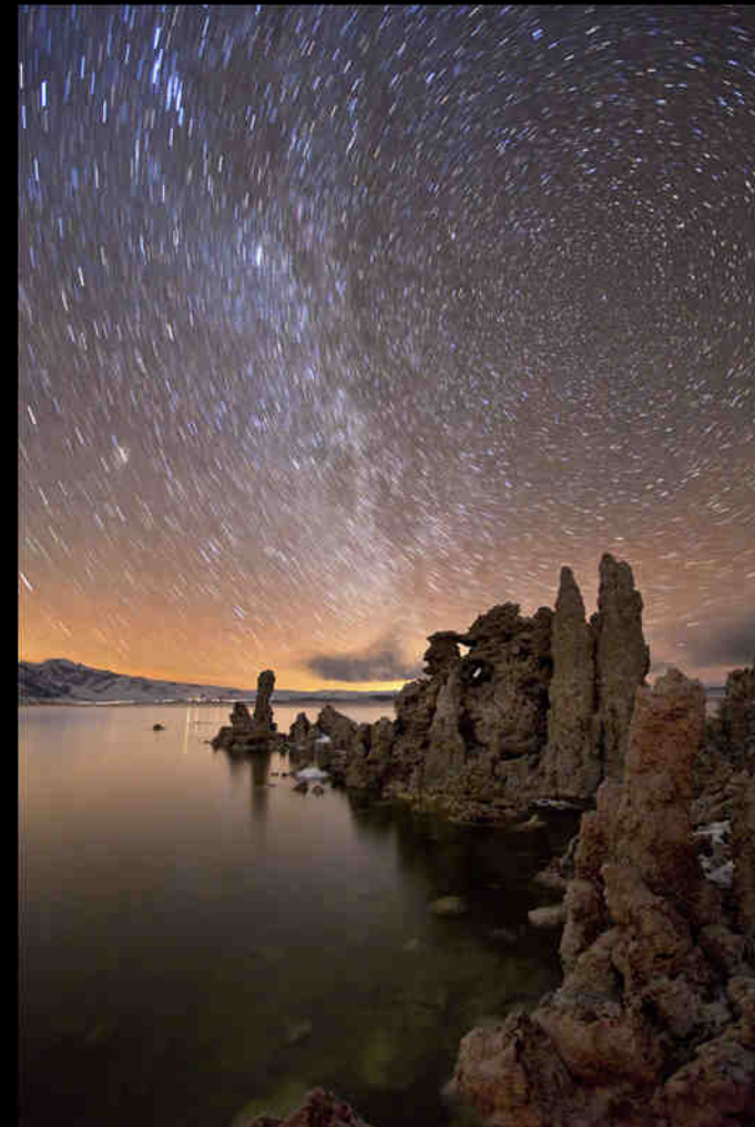
"Startrails above an Alien Lake" by Grant Kaye ( http://grantkaye.com ). The 5th winner for Beauty of the Night Sky category in the 2011 International Earth and Sky Photo Contest. Stars trails around the north celestial pole as photographed from shore of Mono Lake in California. The salty, mineral-laden lake has spindly rock formations which are naturally formed limestone towers known as tufa. Date: 2010 December 30