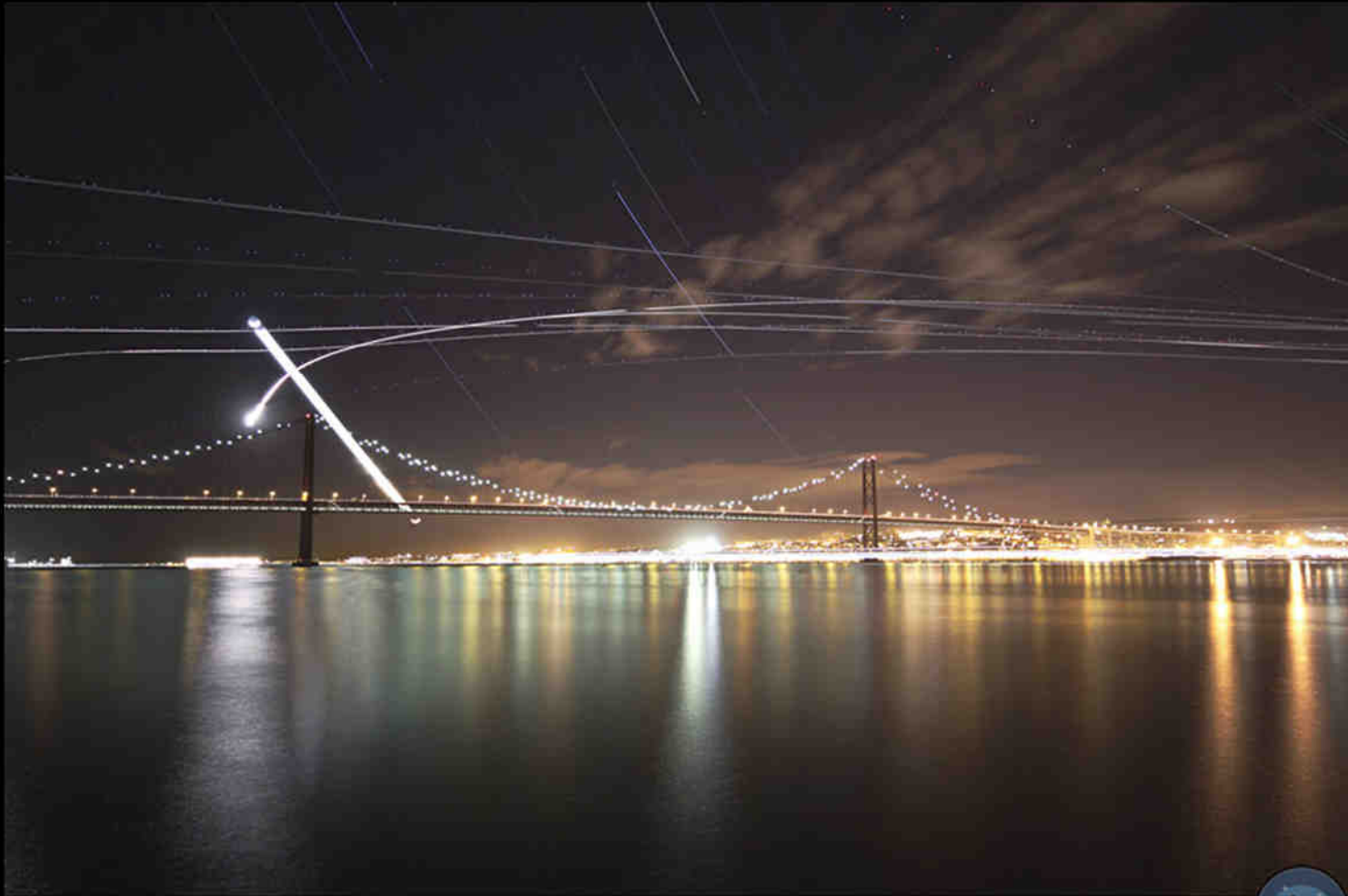
"Lisbon Sky Lights" by Miguel Claro ( http://miguelclaro.com ). The 3rd winner of Against the Lights category in the 2011 International Earth and Sky Photo Contest. Stars and the crescent Moon trail toward the western horizon above the 25 April Bridge (Ponte 25 de Abril) in Lisbon, Portugal. There are also many trails by airplanes to or from the Lisbon airport including the bright light crossing the moontrail. Date: 2010 February 17